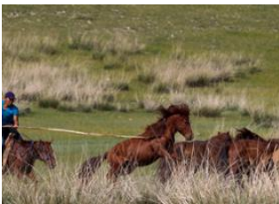
Tsenkher hot springs 📍 🚗 40km - ⌚ 1h Tsetserleg 📍 🚗 215km - ⌚ 5h 30m Jargalant at Bayarsaikhan's 📍