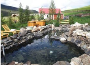
Khogno Khan 📍 🚗 250km - ⌚ 4h Tsenkher hot springs 📍