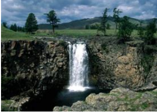
Orkhon valley 📍 8km - 🕒 2h Orkhon waterfalls 📍 Orkhon valley 📍