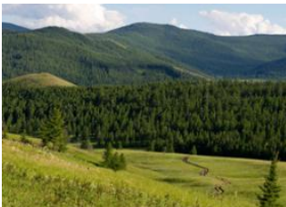
Orkhon valley 📍 🚗 180km - 🕒 5h Naiman nuur 📍