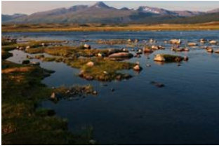
Khurgan lake 📍 20km - ⌚ 4h Khoton lake 📍 20km - ⌚ 4h Khoton lake 📍