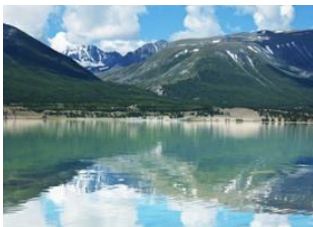
Syrgaal area 📍 25km - ⌚ 4h 30m Khurgan lake 📍