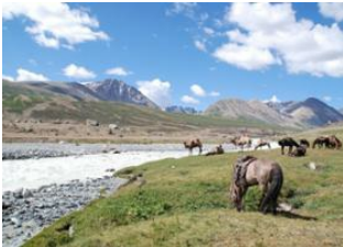
Khoton lake 📍 45km - ⌚ 9h Tahilbai valley 📍