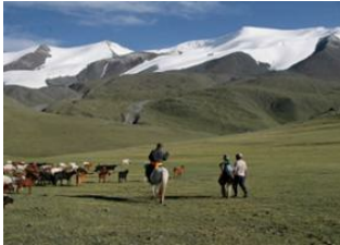
Altai mountain pass 📍