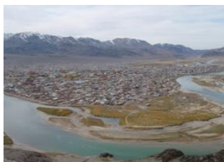
Ulan Bator 📍 ✈️ 1700km - ⌚ 2h Olgii 📍