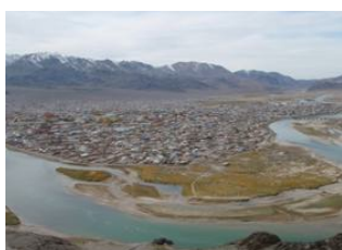
Ulan Bator 📍 ✈️ 1700km - ⌚ 2h Olgii 📍