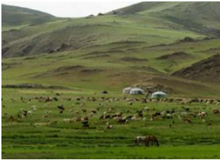
Khangai - Myagmar family 30km - ⌚ 6h Khangai - Erdenebat family