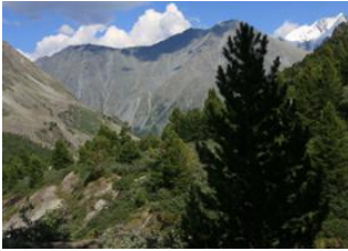
Tahilbai valley 📍 36km - 🕒 7h Altai mountain pass 📍