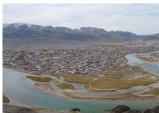
Ulan Bator 📍 ✈ 1700km - ⌚ 2h Olgii 📍