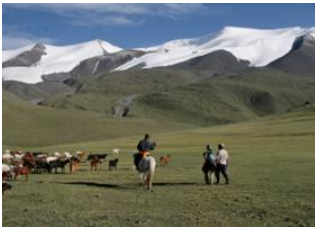
Altai mountain pass 📍 18km - 🕒 4h Shiveet Khairkhan 📍