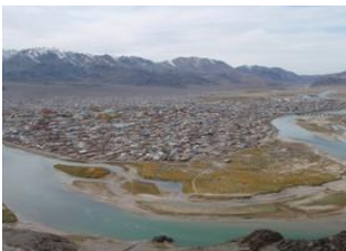
Shiveet Khairkhan 📍 🚗 220km - 🕒 6h 30m Olgii 📍