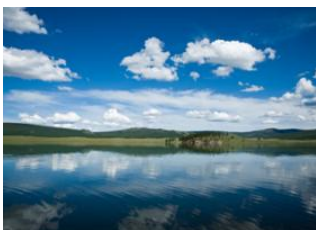
Ulan Bator 📍