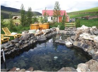
Terkhiin Tsagaan national park 215km - 5h Tsenkher hot springs