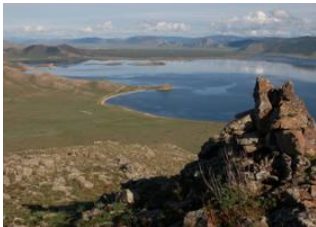
Chuluut river 📍 🚗 120km - ⌚ 4h Terkhiin Tsagaan national park 📍