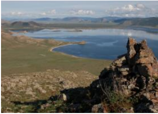
Chuluut river 120km - 4h Terkhiin Tsagaan national park