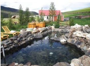
Khangai Mountain 📍 21km Tsenkher hot springs 📍