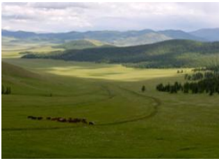
Orkhon valley 📍 60km Khangai Mountain 📍