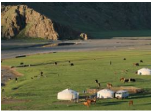
Kharkhorin 📍 🚗 92km Tovkhon monastery 📍 🚗 42km Orkhon valley 📍