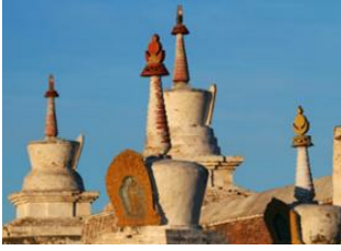
Khustai national park 📍 🚗 270km Kharkhorin 📍