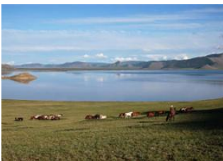
Suman river 📍 20km - ⌚ 4h Tariat 📍