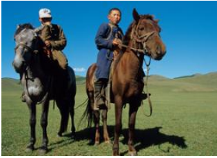
Agt valley 📍 25km - ⌚ 5h Burgat 📍