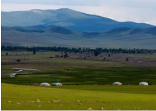
Chuluut river 📍 20km - ⌚ 4h Suman river 📍