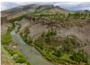
Khanui River 📍 38km - ⌚ 6h Chuluut river 📍