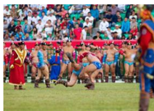
Ulan Bator 📍