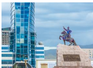
Ulan Bator 📍