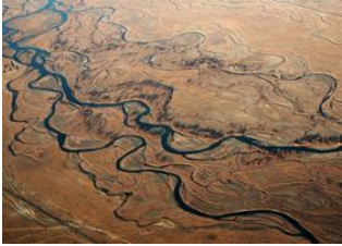
Flight back 📍