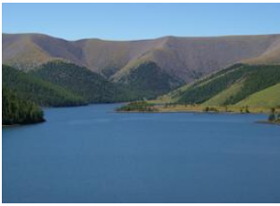
Gyatraunii am 📍 50km - ⌚ 14h Naiman nuur 📍