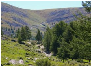
Shuranga river 📍 20km - ⌚ 5h Uvur Gyatruun 📍