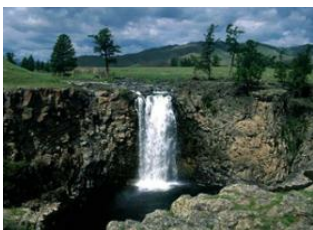
Orkhon valley 📍 23km - ⌚ 5h 45m Gyatruunii am 📍 Uuragt Valley 📍