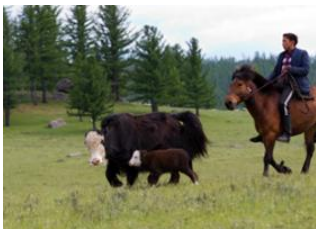
Uvur Gyatruun 📍 38km - ⌚ 10h Orkhon valley 📍