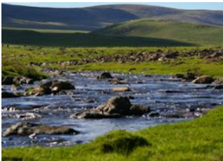
Naiman nuur 📍 30km - ⌚ 5h Shuranga river 📍