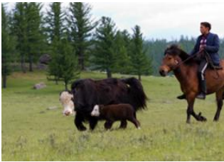
Uvur Gyatruun 📍 38km - ⌚ 10h Orkhon valley 📍