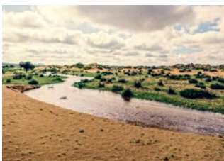
Orkhon valley 📍