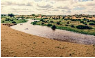
Orkhon valley 📍