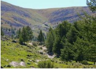
Shuranga river 📍 20km - ⌚ 5h Uvur Gyatruun 📍