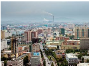
Khogno Khan 📍