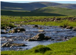
Naiman nuur 📍 30km - 🕒 5h Shuranga river 📍