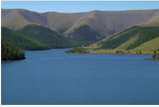
Gyatraunii am 📍 50km - 🕒 14h Naiman nuur 📍