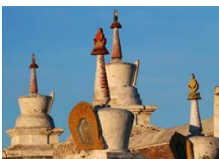
Ulan Bator 📍 🚗 380km - ⌚ 6h Kharkhorin 📍