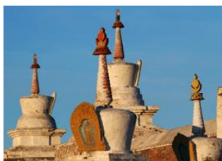
Ulan Bator 📍 🚗 380km - ⌚ 6h Kharkhorin 📍