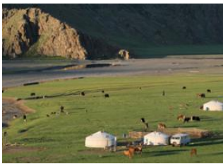
Khangai Mountain 📍 60km Orkhon valley 📍