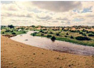
Naiman nuur 📍 🚗 260km - ⌚ 6h 30m Khogno Khan 📍