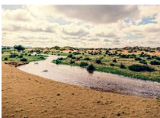
Orkhon valley 📍 🚗 240km Khogno Khan 📍