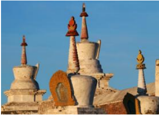
Khustai national park 📍 🚗 270km Kharkhorin 📍