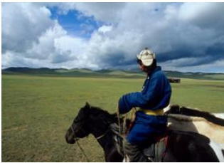
Kharkhorin 📍 🚗 52km Khujirt 📍