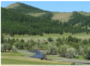
Terelj Village 📍 30km - 📍 8m Terelj national park 📍