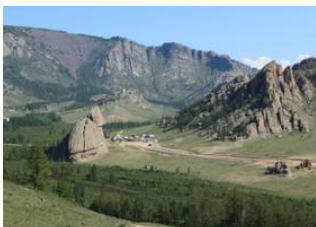
Ulan Bator 📍 🚗 80km - ⌚ 2h Terelj Village 📍