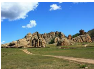
Black lake 📍 20km - ⌚ 5h Khagiin Khar pasture 📍 17km - ⌚ 4h 30m Terelj national park 📍