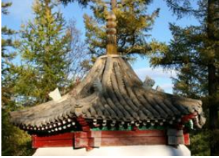
Terelj national park 📍 27km - ⌚ 6h Gunj monastery 📍