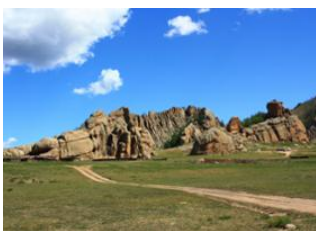
Black lake 📍 20km - ⌚ 5h Khagiin Khar pasture 📍 17km - ⌚ 4h 30m Terelj national park 📍