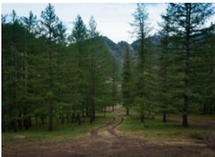
Gunj monastery 📍 23km - ⌚ 5h Terelj national park 📍