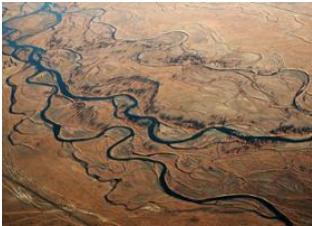
Flight back 📍