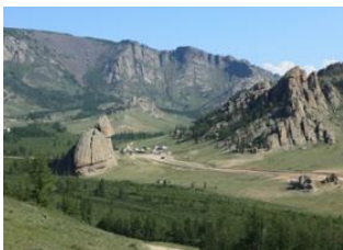
Ulan Bator 📍 🚗 80km - ⌚ 2h Terelj Village 📍