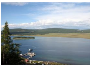
Ulan Bator 📍