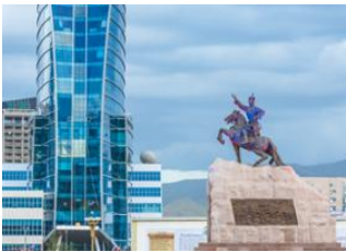
Ulan Bator 📍