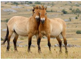
Ulan Bator 📍 🚗 130km - ⌚ 2h 30m Khustai national park 📍