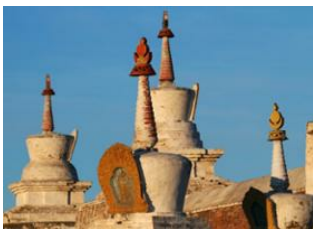
Khustai national park 📍 🚗 270km - ⌚ 4h 30m Kharkhorin 📍