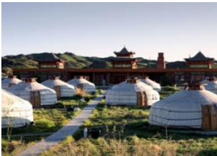
Orkhon valley 📍 🚗 310km - ⌚ 8h Ongi monastery 📍