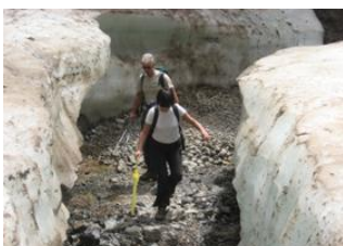
Khongor sand dunes 📍