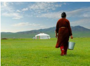
Ulan Bator 📍 🚗 60km - ⌚ 2h 40m Mongol Nomadic camp 📍