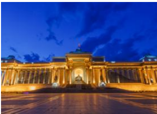
Ulan Bator 📍