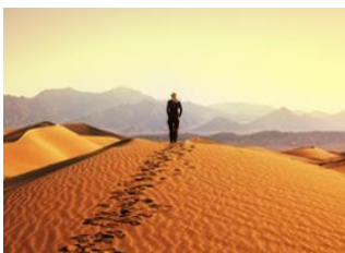
Bayanzag 📍 🚗 130km - ⌚ 4h 20m Khongor sand dunes 📍