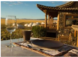
Ongi monastery 📍 🚗 150km - ⌚ 4h 30m Bayanzag 📍