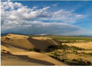
Mongol Nomadic camp