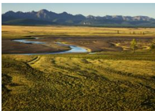
Oliin Dawaa 📍 🚗 80km - ⌚ 3h Tsagaan nuur 📍