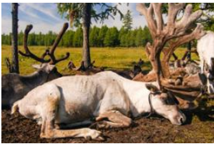
Tsagaan nuur 📍 40km - ⌚ 7h Tsaatan camp 📍