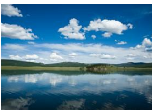
Ulan Bator 📍