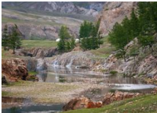
Alag Tsar 📍 🚗 170km - ⌚ 6h Oliin Dawaa 📍