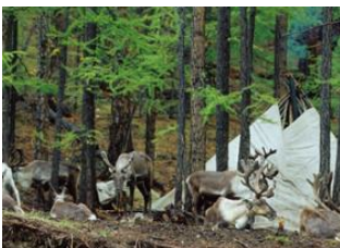
Tsaatan camp 📍 40km - ⌚ 7h Tsagaan nuur 📍