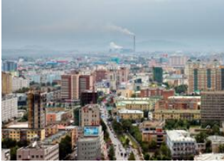
Terelj national park 📍