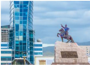
Khogno Khan 📍 🚗 280km - ⌚ 4h 30m Ulan Bator 📍