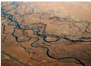
Flight back 📍