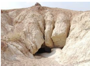
Dorgon lake 📍