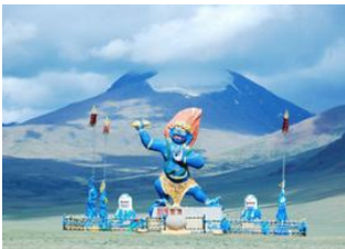
Uliastai 📍 🚗 190km - ⌚ 5h Otgontenger mountain 📍