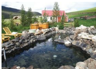
Orkhon valley 📍