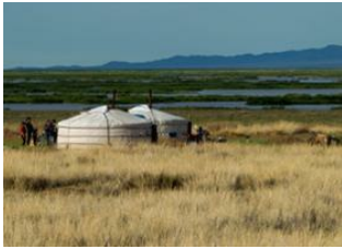
Mongol els sand dunes 📍