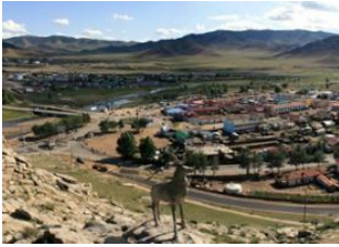
Ider river 📍 🚗 220km - ⌚ 6h Uliastai 📍