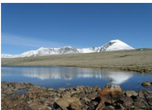
Otgontenger mountain 📍 🚗 145km - ⌚ 4h Tsagaankhairkhan 📍