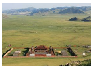
Ulan Bator 📍