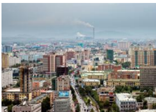
Ulan Bator 📍