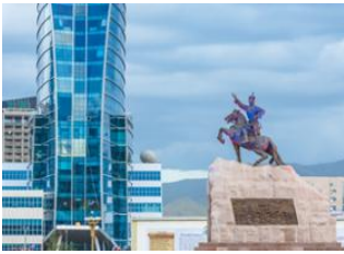
Terej national park 📍 🚗 80km - ⌚ 2h Ulan Bator 📍