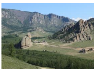
Ulan Bator 📍 🚗 80km - ⌚ 2h Terelj Village 📍