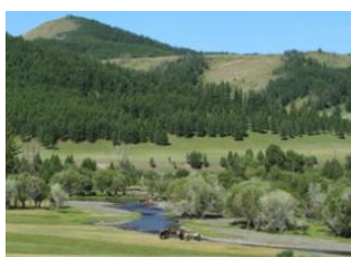
Terelj Village 📍 25km - ⌚ 6h Terelj national park 📍