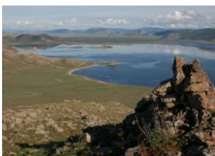
Shine Ider 📍 🚗 180km - ⌚ 6h Terkhiin Tsagaan national park 📍