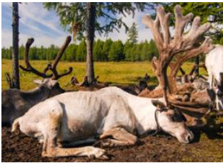
Tsagaan nuur 📍 40km - ⌚ 7h Tsaatan camp 📍