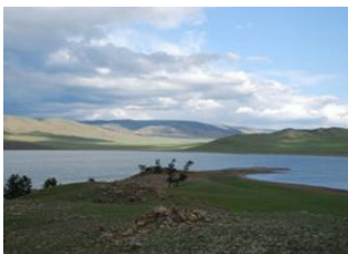
Beltes river 📍 🚗 250km - ⌚ 7h Shine Ider 📍