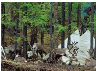
Tsaatan camp 📍 40km - ⌚ 7h Tsagaan nuur 📍