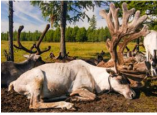
Tsagaan nuur 📍 40km - ⌚ 7h Tsaatan camp 📍