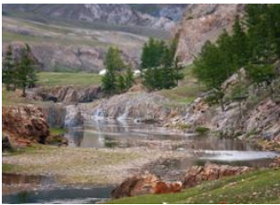
Alag Tsar 📍 🚗 170km - ⌚ 6h Oliin Dawaa 📍