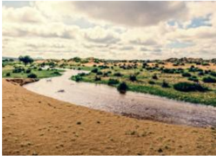
Orkhon valley 📍