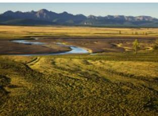
Oliin Dawaa 📍 🚗 80km - ⌚ 3h Tsagaan nuur 📍