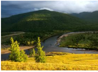
Tsagaan nuur 📍 🚗 160km - ⌚ 6h 30m Beltes river 📍