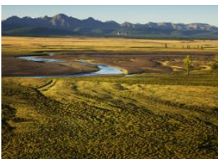
Oliin Dawaa 📍 🚗 80km - ⌚ 3h Tsagaan nuur 📍