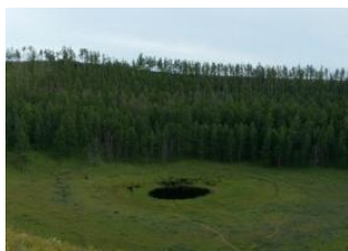
Ulan Bator 📍