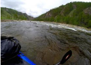
Packrafting day 1 - drop point 2 📍