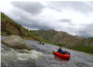
Packrafting day 1 - drop point 2 📍 Packrafting - Fast running water exit point 📍 Packrafting day 1 - drop point 2 📍