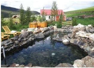
Böörjiin Oroï 📍 🚗 190km - ⌚ 6h Tsenkher hot springs 📍