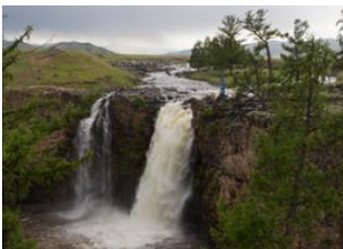
Orkhon valley 📍 37km - ⌚ 5h 30m Böörgiin Oroi 📍