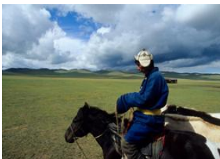
Kharkhorin 📍 42km - ⌚ 6h 30m Khujirt 📍