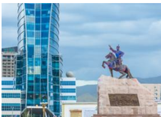
Ulan Bator 📍