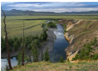
Khujirt 📍 35km - ⌚ 5h Uurt 📍