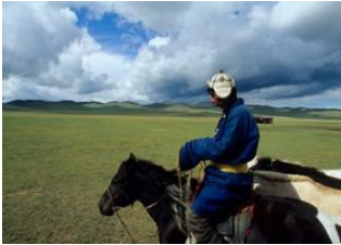
Kharkhorin 📍 42km - ⌚ 6h 30m Khujirt 📍