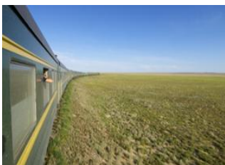
Ulan Bator 📍 🚆 450km - ⌚ 10h Sainshand 📍