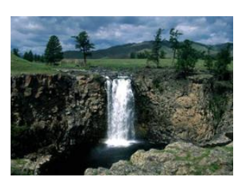
Orkhon valley ♥ 8km - ④ 1h 30m Orkhon waterfalls ♥ Orkhon valley ♥

• Those who wish will go pony trekking along Orkhon Valley, from the camp until Orkhon waterfalls .