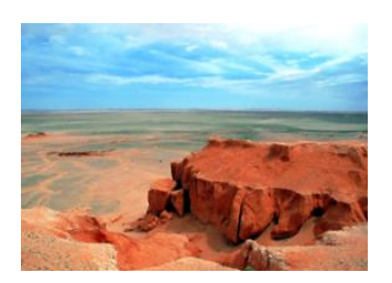
Ongi monastery ♥ ♣ 150km - ④ 4h 30m Bayanzag ♥