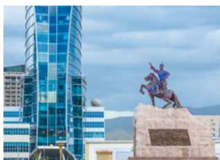
Ulan Bator 📍