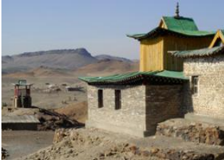
Orkhon valley 📍 🚗 310km - ⌚ 8h Ongi monastery 📍