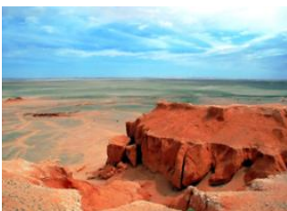
Ongi monastery 📍 🚗 150km - ⌚ 4h 30m Bayanzag 📍