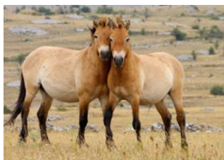
Ulan Bator 📍 🚗 130km - ⌚ 2h 30m Khustai national park 📍