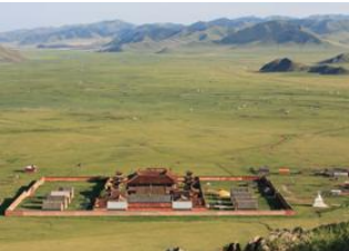
Ulan Bator 350km - 5h 30m Amarbayasgalant