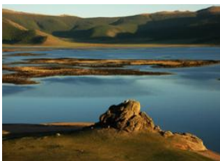
Shine Ider 🚗 180km - ⌚ 6h Terkhiin Tsagaan national park