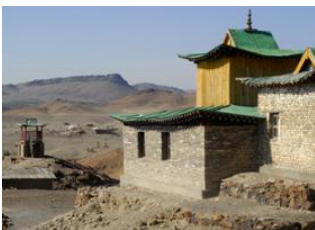
Kharkhorin 📍 🚗 260km - 🕒 5h Ongi monastery 📍