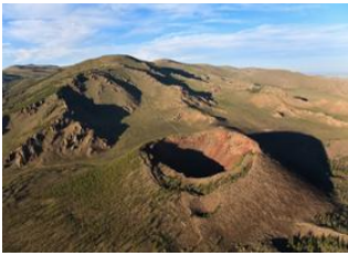
Terkhiin Tsagaan national park 📍