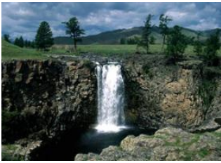
Orkhon valley 📍 8km - 🕒 1h 30m Orkhon waterfalls 📍 Orkhon valley 📍