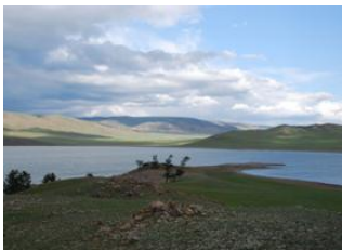
Alag Tsar 🚗 130km - ⌚ 3h Moron 🚗 130km - ⌚ 3h Shine Ider