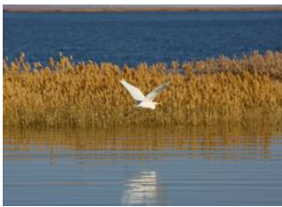
Dashinchilen ♡ 🚲 130km - ⌚ 4h 30m Ogii lake ♡