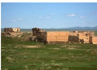
Ulan Bator 📍 🚲 230km - ⌚ 5h 30m Dashinchilen 📍