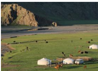
Tsenkher hot springs ♡ 🚲 150km - ⌚ 5h 30m Orkhon valley ♡