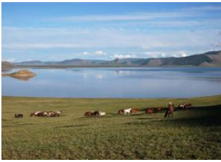
Suman river 📍 20km - 🕒 4h Tariat 📍