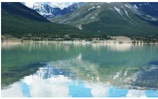
Khoton lake 📍 14km - ⌚ 4h Khurgan lake 📍