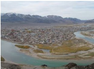
Khurgan lake 📍 🚗 220km - ⌚ 6h 30m Olgii 📍