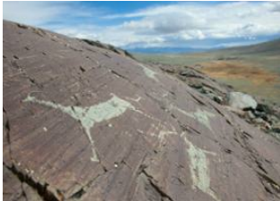
Shiveet Khairkhan 📍 25km - ⌚ 5h Tsagaan river 📍