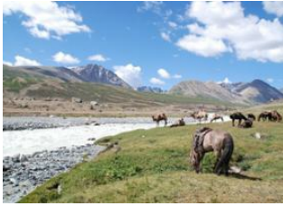
Altai mountain pass 📍 20km - ⌚ 5h Tahilbai valley 📍