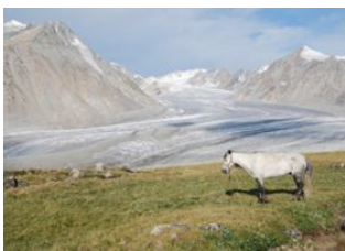
Tsagaan river 📍 16km - ⌚ 5h Potanine glacier 📍 12km - ⌚ 6h Potanine glacier 📍