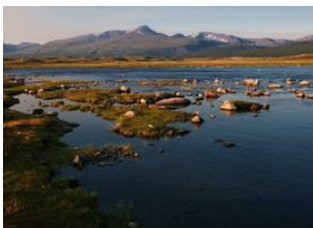
Tahilbai valley 📍 15km - ⌚ 4h Khoton lake 📍