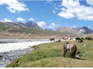
Altai mountain pass 📍 20km - ⌚ 5h Tahilbai valley 📍