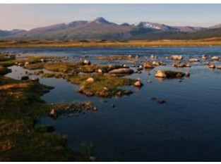
Tahilbai valley 📍 15km - ⌚ 4h Khoton lake 📍