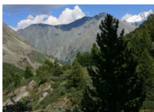
Tsagaan river 📍 36km - ⌚ 11h Altai mountain pass 📍