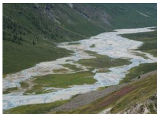
Potanine glacier 📍 20km - ⌚ 6h 30m Tsagaan river 📍