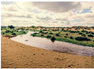
Orkhon valley 📍