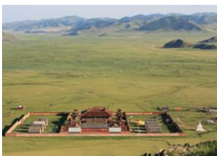
Ulan Bator 📍 🚗 350km - ⌚ 5h 30m Amarbayasgalant 📍