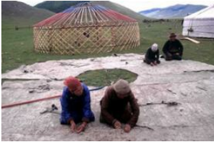
Ondor Ulaan 📍 23km - ⌚ 5h Jargalant 📍