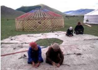
Ondor Ulaan 📍 23km - ⌚ 5h