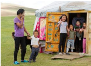
Tsenkher hot springs 📍 🚗 40km - ⌚ 1h Tsetserleg 📍 🚗 120km - ⌚ 3h Ondor Ulaan 📍